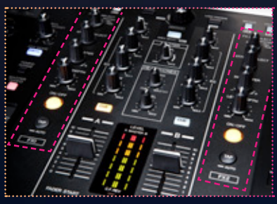
Intelligent effect control area Access Serato Itch's extensive effects suite from the controller.

Optimised audio circuitry in the master output area is taken from our pro DJ equipment and combined with audio characteristics designed specifically for Serato ITCH. The result is superior sound quality that makes the DDJ-S1 a force to be reckoned with.