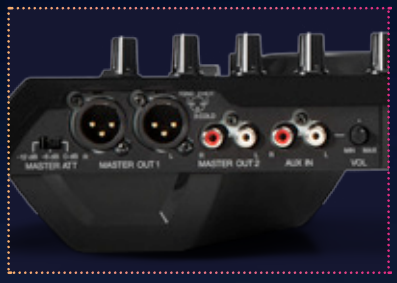
Multiple inputs and outputs Including a balanced XLR input and output for direct connection to PA system with no loss of sound quality.