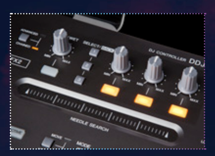
Effect control area Effects area, with six effects, mirrors the TRAKTOR interface for instant familiarity.