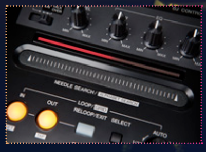
Playing Address feature Clear LED display shows the progression through the track.