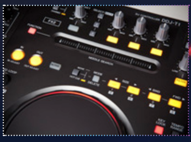
Loop editing Touch of a button control of loop characteristics and timing.