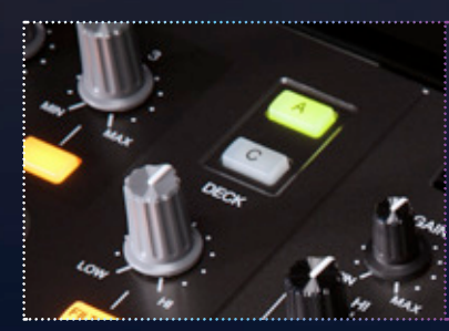
Four-channel deck control Intuitive four channel mixing for the ultimate in flexibility.

The DDJ-T1 delivers the clear, powerful sound the industry has come to expect from Pioneer. Optimised audio circuitry in the master output area ensures high quality sound that has beaten the competition handsdown in listening tests. Plus, audio characteristics optimal for TRAKTOR have also been included to really make this a match made in heaven.