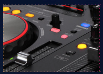
Advanced Pioneer features Including the popular slip mode for looping, reversing and scratching without changing the track's tempo.