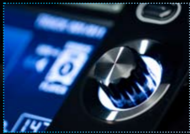
Rotary selector for easy track selection