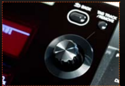
Rotary selector for easy track selection