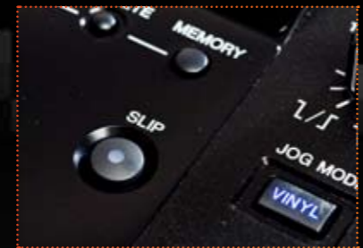
Slip mode allows scratching without affecting track length or losing the beat