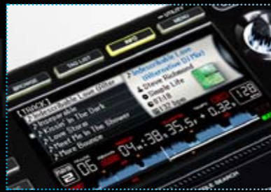
6.1 full colour LCD screen