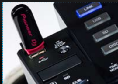
Perform off USB storage devices & SD card