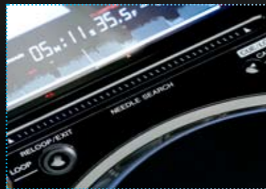
Needle Search bar for rapid track point selection

DJ set preparation has now been revolutionised by the included rekordbox™* music database management software which works in conjunction with the new CDJ-2000 to offer essential performance-enhancing functionality.