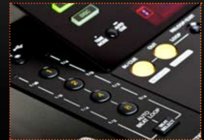
Advanced Auto Beat Loops

The new Slip button lets DJs perform such tricks as looping, reversing or scratching of music without losing the flow or even a beat. The music continues to play, muted, and returns when the hand leaves the platter.