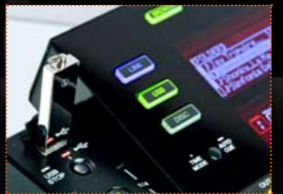
Perform off USB memory storage devices