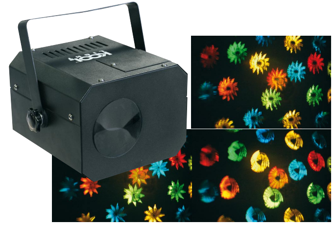
Imported in the Benelux by Pro Audio Trade byba