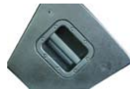
RX112 solid grip