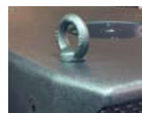
PX112 fly points