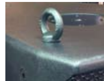
PX110 fly points