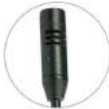
high sensitive condenser microphone