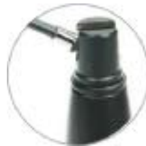
180 degree revolving