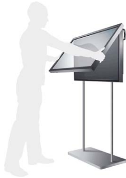
Mounting Image > 'Overlay mounting'